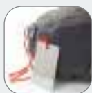
Rear View Mirror (in hip pocket)