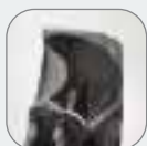
Sun Shade (included)