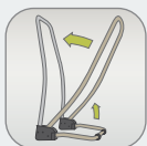
Space-Saver Frame (internal)