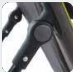
Locking Kick-Out Leg Mechanism