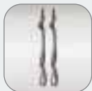
Foot Stirrups (included)