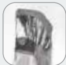
Rain Cover (included)