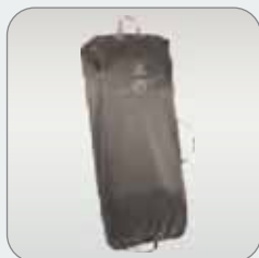
Protective Carry Case (included)