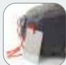
Rear View Mirror (in hip pocket)