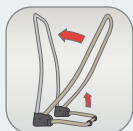
Space-Saver Frame (internal)