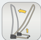
Space-Saver Frame (internal)