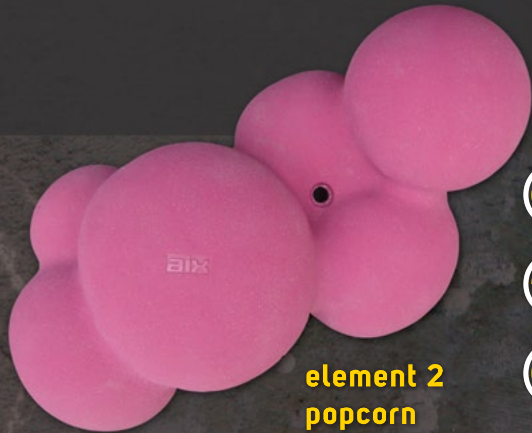
element 2 popcorn