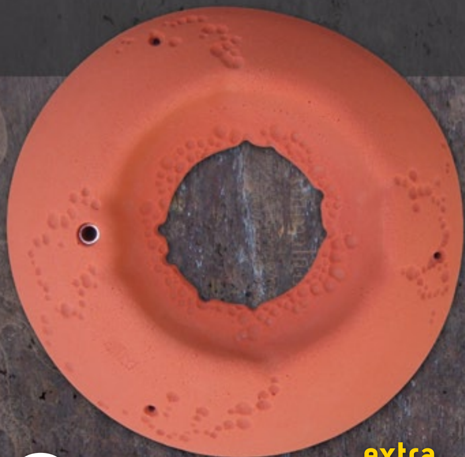
extra crater 2