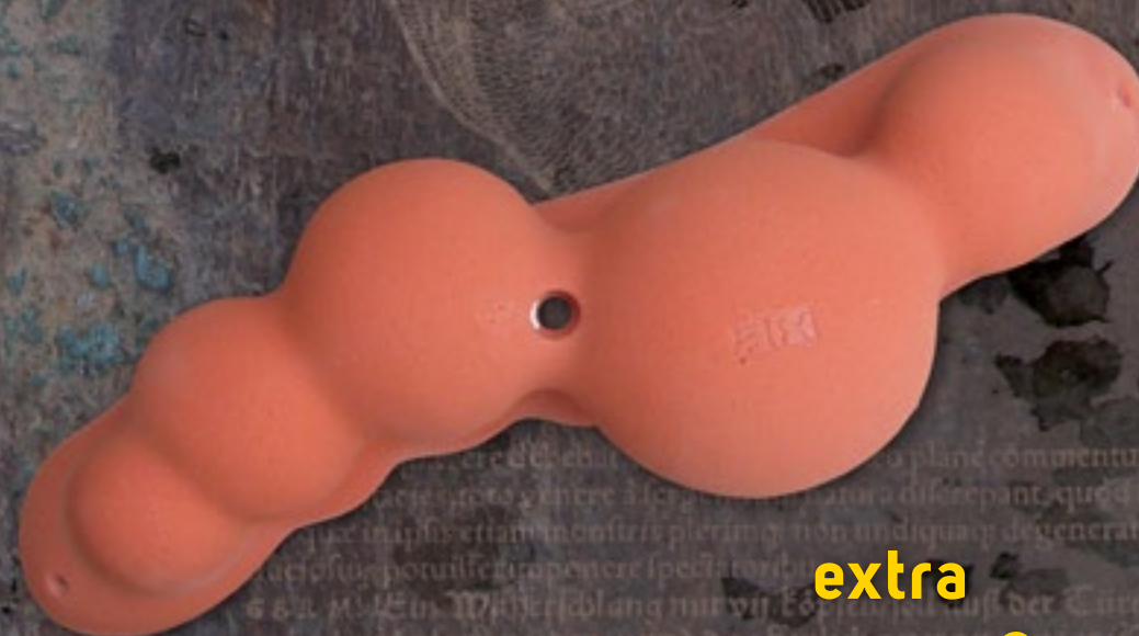
extra worm 3